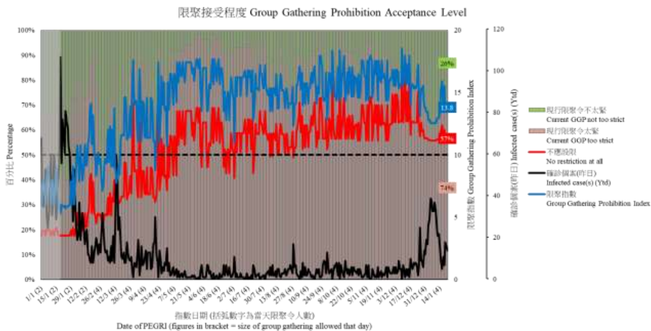
Chart 1: Group Gathering Prohibition Acceptance Level & Group Gathering Prohibition Index

[3] The maximum value is set at 20 persons, according to the simulation of data collected from the latest benchmark survey. This value will be reviewed after each benchmark survey.